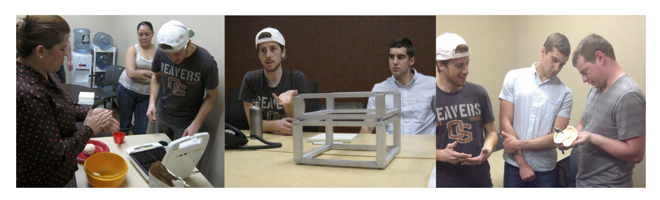
Figure 3: Prototype development and testing

This phase was also conducted in similar fashion to the traditional capstone process. The team made modifications based on feedback from test production runs. The final sope maker (Figure 4) was introduced at an outreach and engagement symposium at the Oregon State University campus. It is important to note that the sole change to the process was made to the cooking rate. This change was in