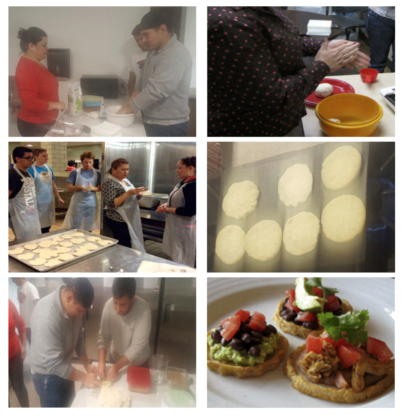
Figure 2a (top left): Step 1 - Hand mix masa; Figure 2b (top right): Step 2 - Roll masa into ball; Figure 2c (middle left): Step 3 - Shape masa; Figure 2d (middle right): Step 4 - Cook sopes; Figure 2e (bottom left): Step 5 - Shape sopes into bowl; Figure 2f (bottom right): Step 6 - Garnish and serve

(Malhotra et al., 2007). In these projects, "shared suffering" is an opportunity to increase mutual learning by alternating design-meeting locations between community and university sites.