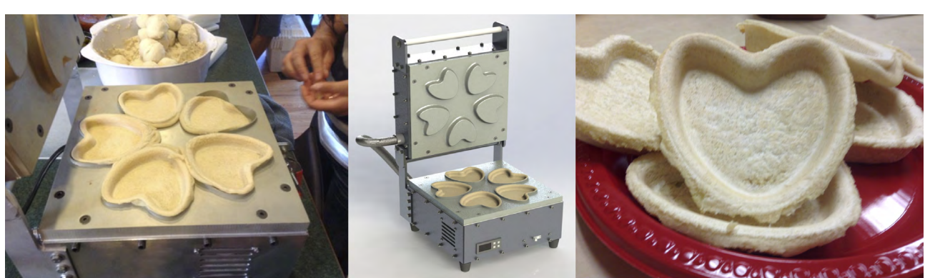
Figure 4: Final design and output

response to the community partners' desire to sell the sopes at a local co-op and at catered events. The sope mixture, which is the artisan portion of the process, did not change.