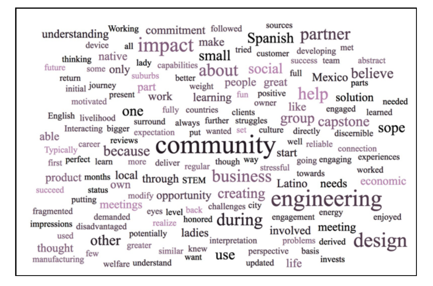
Figure 6: Word cloud from student feedback

ries at the farms he supervised. He felt I was too young, but I begged him to take me to work because I wanted to help support the family. Working with the Latino community in the farms and meeting a lot of great people through my experiences, I knew I wanted to help the Latino community through the use of my career (engineering). The reason why I selected this project was because I have the connection with the